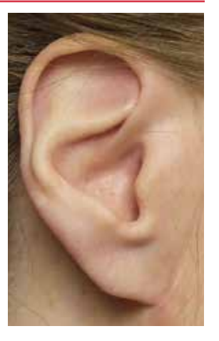
Fundamental failings of surgical reconstructions (left) and poor prostheses lacking refinement by competitors (middle) are apparent. The improvements we offer in aesthetics and durability can be dramatic (right) and have a dramatic effect on the wearer's feeling about themselves and their appearance.